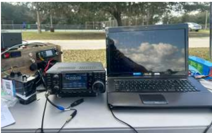
Thanks, Carl, KC5CMX