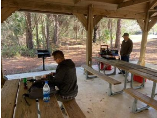
Pics right and left courtesy of KW5BG