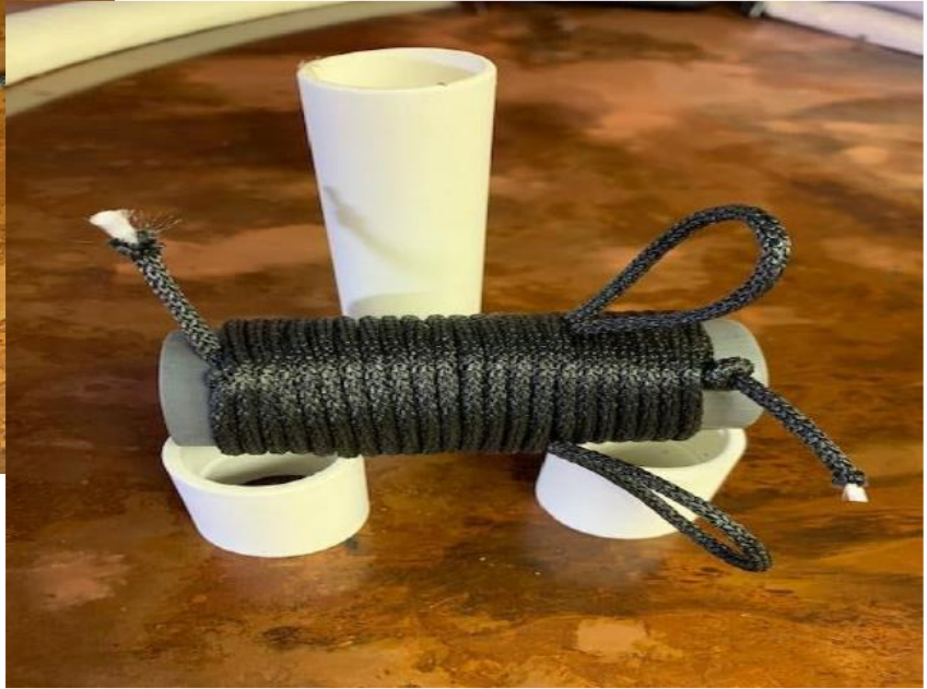
(Below) Finished project! Efficient high guy point that requires NO drilling, no metal fasteners to scratch fiberglass pole and..... it cost a dollar to make it!!