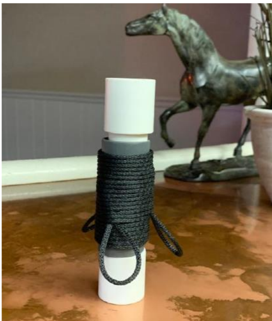
I will test it out later in the week and let you know how we do. Pretty sure it's a winner ! No plans, no YouTube video, just farm supplies and .....