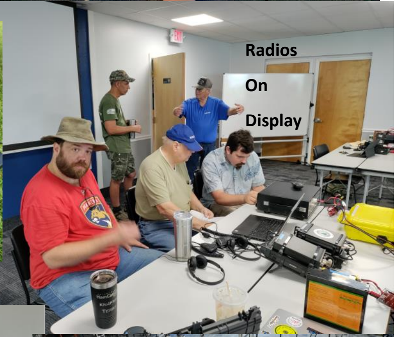
Radios On Display