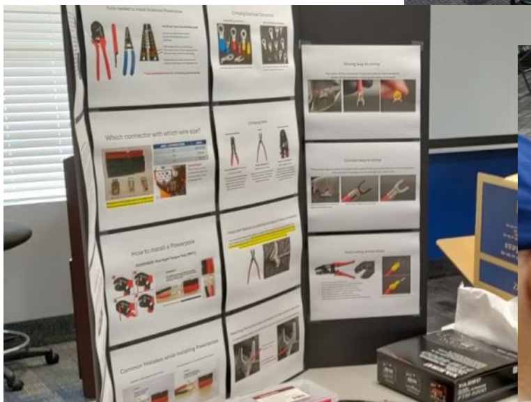
Ethan KQ4EIC Andersen Power Pole Display